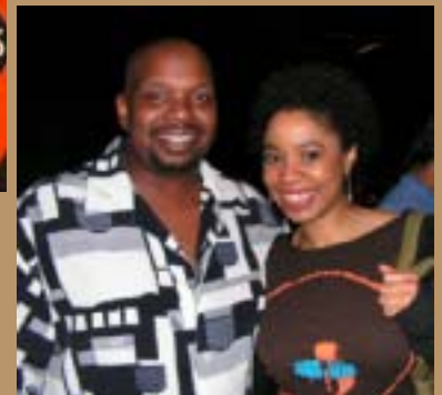
Billy "O" &